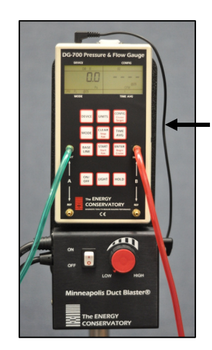
Fan control cable with Duct Blaster controller.